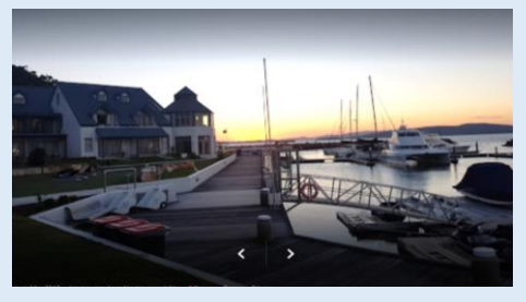
The Anchorage Hotel & Spa