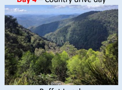
Buffet Lunch Dinner at The Anchorage